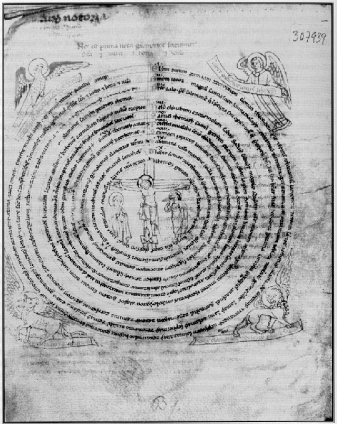
The First Note of Grammar