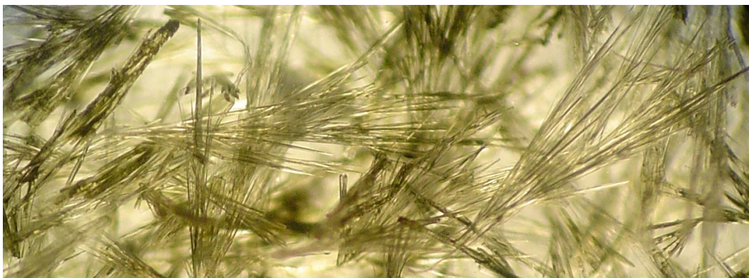
Above photograph: Salvinorin crystals submerged in naphtha.

This extraction and refinement method was worked out and written by an amateur experimenter. I'm not an organic chemist and don't work in a field related to botany or chemistry. The solvents mentioned in this document are very flammable and can be easily ignited by red hot surfaces, open flame, electric or static spark! Avoid risking electric or static sparks from any source and don't try to evaporate solvents in closed areas. Do not use stirring utensils, containers or seals which can react with solvents as any contamination by plastics will completely ruin the extraction which then must be thrown away. This document does not contain enough information to know how to safely handle solvents or their proper use for the manufacture of human consumable products and is not intended to imply that anything produced by this method can safely be used as a food or drug.