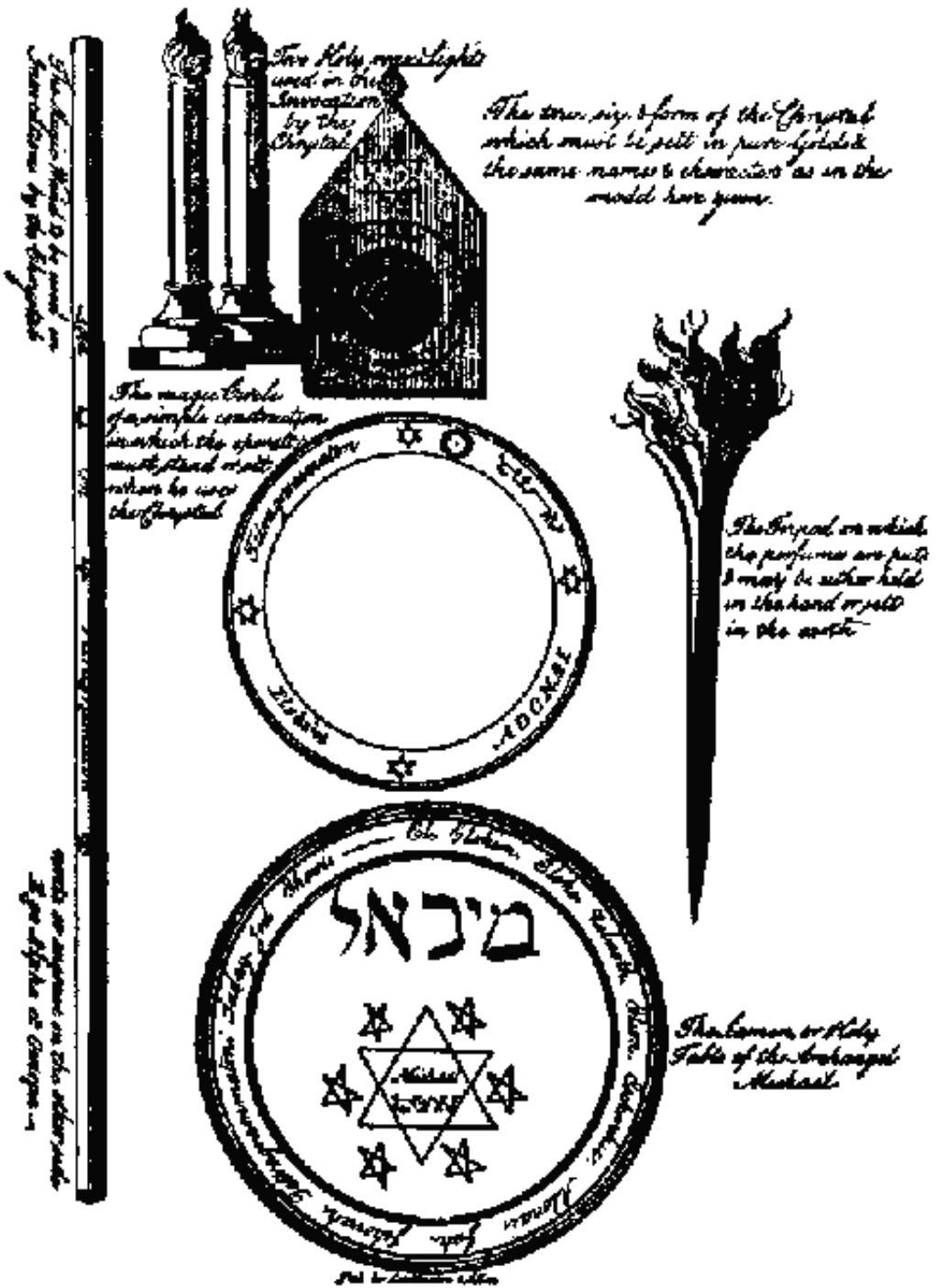
The Magic Instruments of Art Figure I